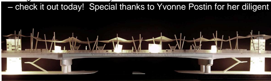
Model of Proposed Wadsworth Bridge